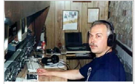
By Goose Steingass, W8AV