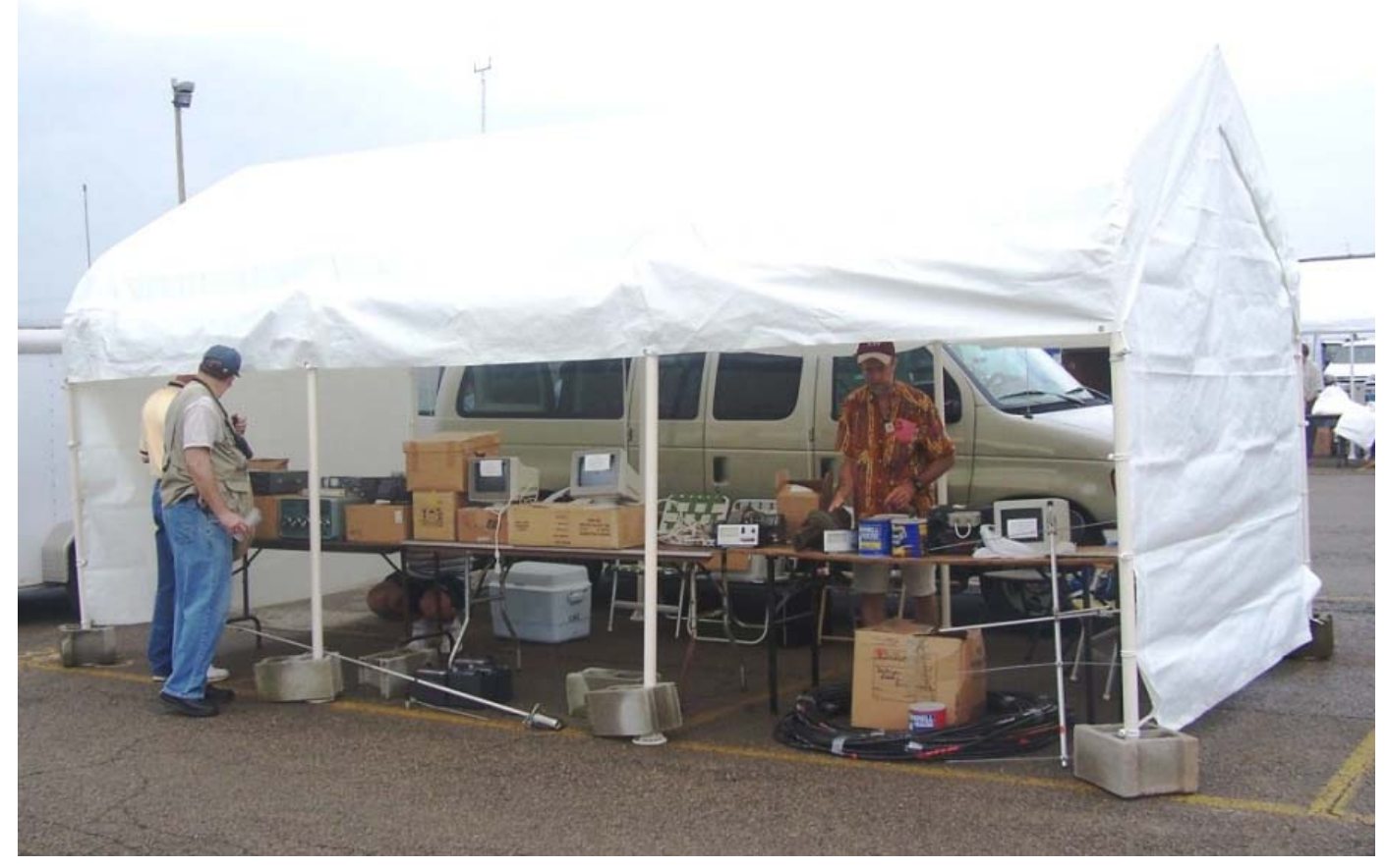
Jim, K8MR manning the MRRC "Suite In The Sun" at Dayton 2004

We'll see you all in Dayton soon! (And cross your fingers for some good weather!