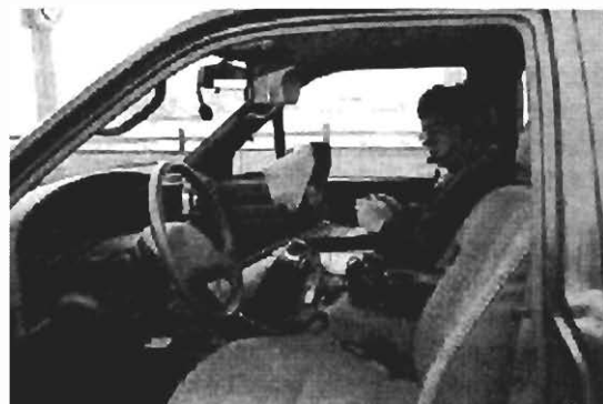
WX3M operating AA8U/m during the 2000 MQP .