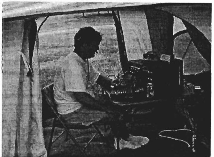
K9TM at the 40M/15M station