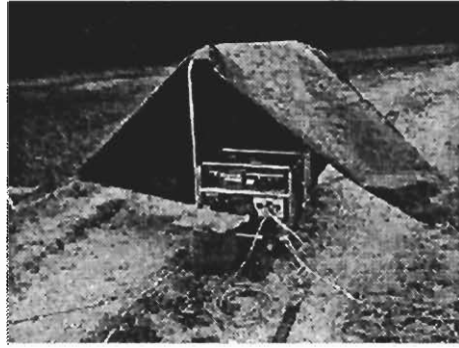
K8MAD Power & Light Company