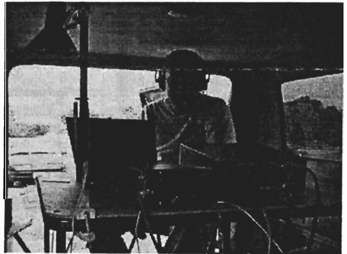
K8CC at the 6M/2M station