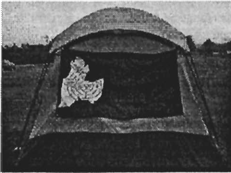
Proudly Showing MRRC Colors