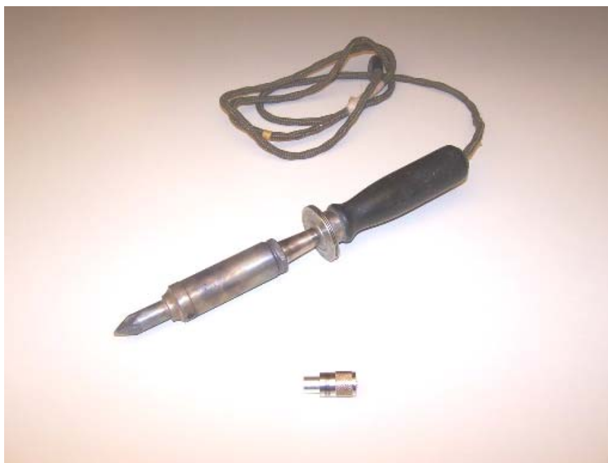
Black Beauty Soldering Iron (with a PL-259 to show scale)

With the right tools, your coax connections will be more reliable, which prevents failures at inconvenient moments. In recent years I'd taken to the "K9TM cable postulate"; that is, "Life is too short to make your own cables". The consequence was that I'd taken to buying pre-made cables from companies like Cable XPerTs. But now that I have the right tools and the right procedure, installing PL-259s on coax cables is no longer dreaded, but is almost fun. And it's a highly useful skill when you need to make specialized cables for your next big array □