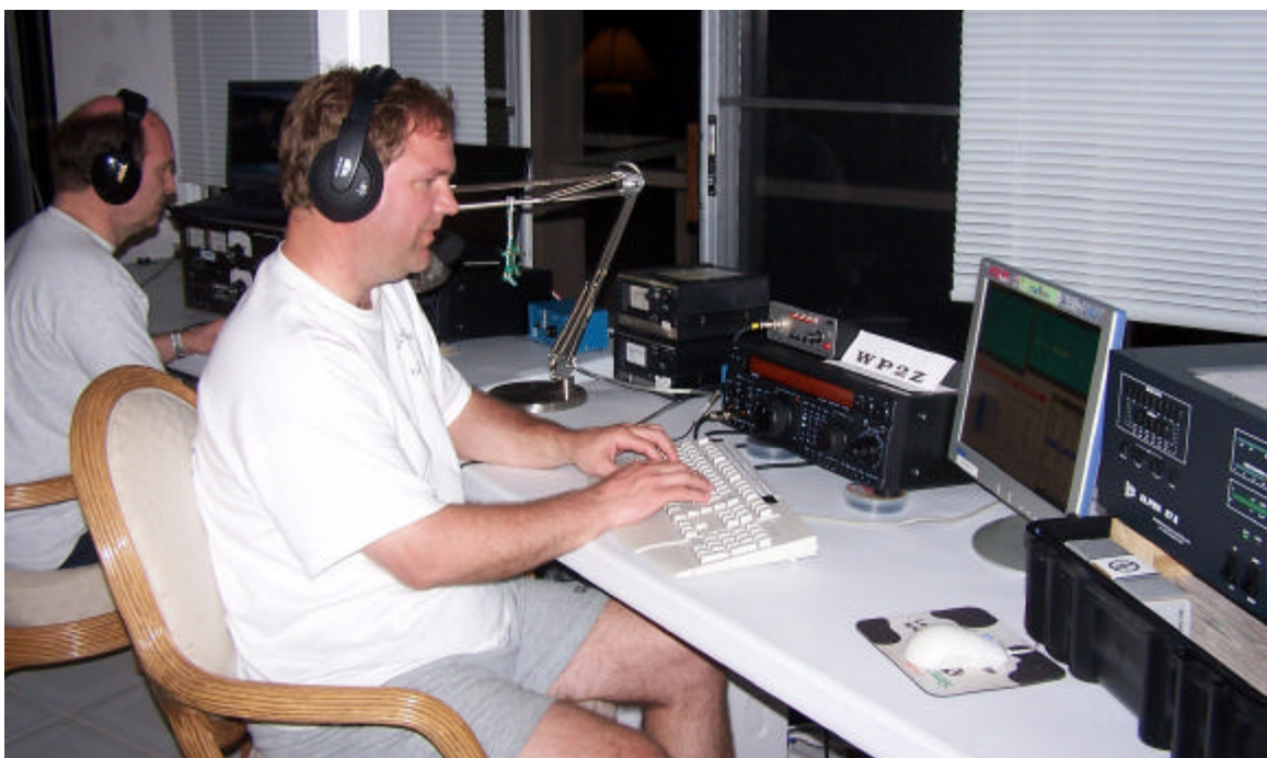
MRRCCers Tim/K9TM (r) and Ev/WZ8P (l) keeping up the rate at WP2Z during the 2004 CQ WPX SSB

Respectfully Submitted, Dennis Ward, KT8X