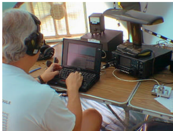
W8AV Keeping The Rate Up on 20CW

K8MAD VHF Antennas The Only Ones Which Show Up In Pictures All The Rest Are Wires