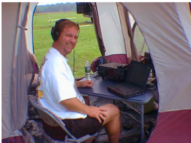
K9TM Enjoying Himself On 40 Meters