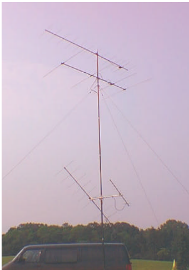
4L 6M, 13L 2M, 145/435 Satellite Yagis

K8MAD VHF Antennas The Only Ones Which Show Up In Pictures All The Rest Are Wires