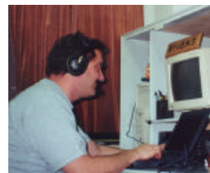
The 'Big Fish' Working The Multitudes As BY4BNS/KT8X

K8MAD is planning to light up the Field Day airwaves again this year in Cleveland. Although many of us have local club type plans, if you're available come out and join the K8MAD gang. It's a great location for FD. Also upcoming are IARU HF in conjunction