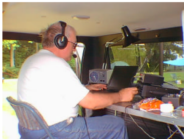
K8CC On 50/144/Satellite